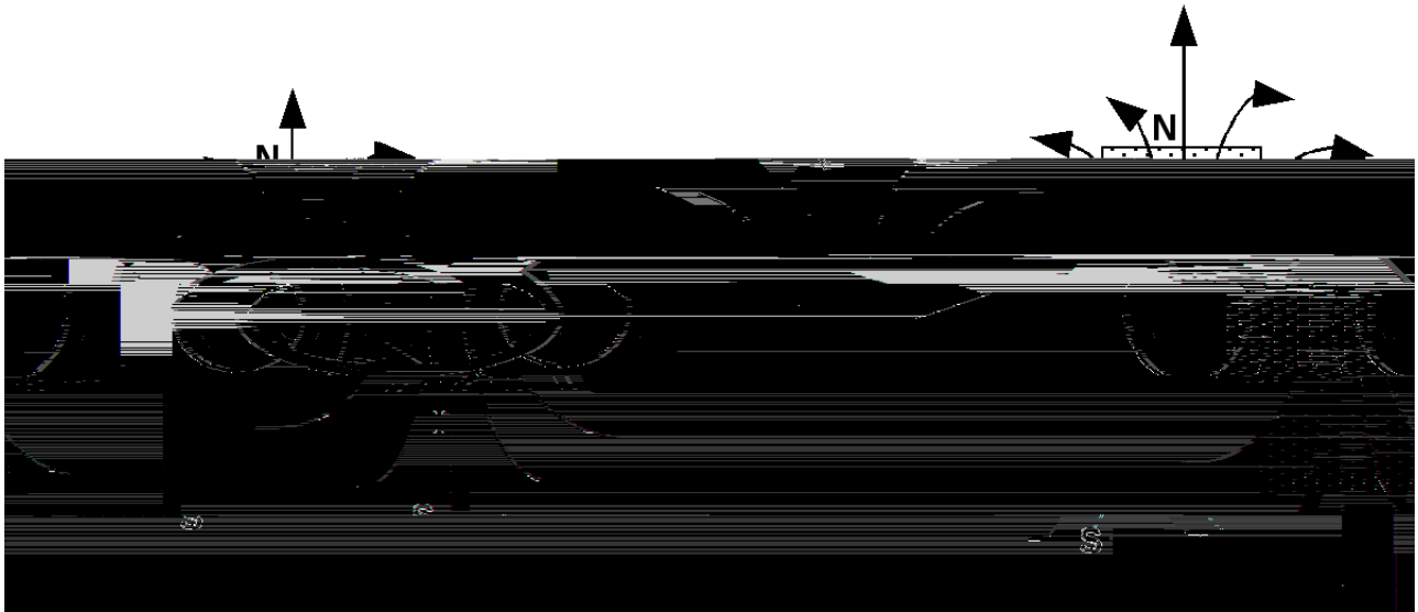
Figure 2: Magnetic field lines for a current loop and a bar magnet. Here the z-axis is along the North-South line.

We can create a stronger and more uniform magnetic field by aligning two identical current loops. A particular configuration that we will be using is known as a Helmholtz coil. This consists of two current loops, each with N turns and radius R . The two loops are aligned along their axis and are separated by a distance R , identical to the radius, each carrying equal steady currents in the same direction (see Figure 3). We can use the Biot-Savart law to find the magnetic field at any point along the axis of the Helmholtz coil by summing the individual magnetic fields of the coils via the superposition principle. It can be shown that the magnetic field at the center of this configuration when z=0 (point O on Fig. 3) is given by